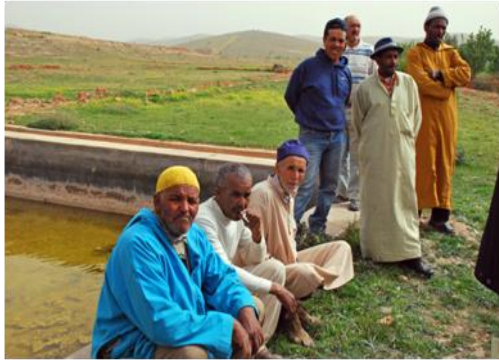
Saffron farmers in supported by Migrations et Développement

In the afternoon, a visit to a saffron cooperative in the vicinity of the small town of Taliouine highlighted the sorts of rural development projects carried out by Migrations et Développement. M&D had played a key role in initiating this development by installing wells, pumps and a collective irrigation system as well as by organising the farmers into a cooperative. The farmers' own contribution consisted of making the soil arable by breaking the crust, removing stones and ploughing. M&D further supports the cooperative by developing opportunities for the commercialisation of saffron, including the opening