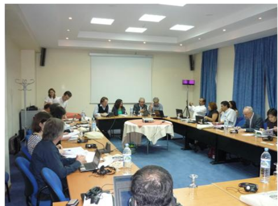
Opening session of the study tour

On the first day of the study tour in the region of Ouarzazate, a series of presentations outlined the objectives of the project and this study tour, and reviewed the main results from the previous field visit in Zacatecas. The presentations provided a comparative perspective on the interactions between migration and development in Mexico and Morocco, including a review of the activities of the Fondation Hassan II pour les Marocains Résidents à l'Étranger and an insight into Mexican policies for migration and development.