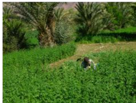
A woman working in a plot of land in the oasis

The field visits confirmed that integration in receiving societies often coincides with increased capabilities to invest in Morocco. Migrants' socio-economic status and education, as well as their integration in receiving countries, have been crucial factors enabling their investments in Morocco as well as their participation in collective development initiatives. For instance, the rose distillery was initiated by a chemist trained in Morocco and in France who relied on his technical