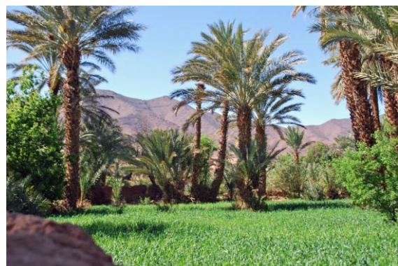
Clover cultivation in the oasis near Agdz

This crisis around the collective management of water resources has encouraged land owners to dig private wells and install diesel pumps on their plots. Those who did so were primarily emigrants, as remittances enabled them to make these