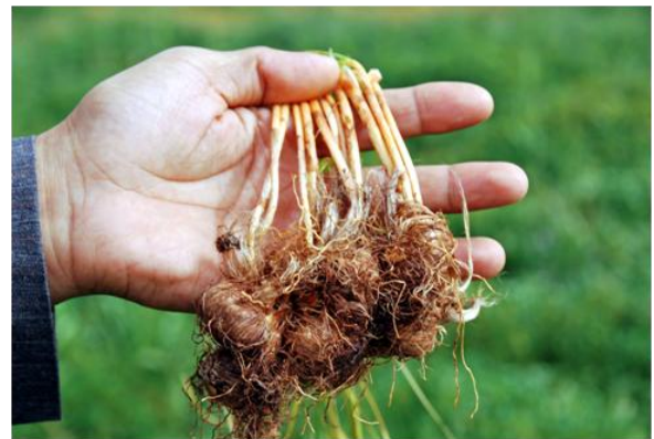
Bulbs of the saffron plant extracted from one of the plots cultivated with the support of the association Migrations et Développement

One of the strategies pursued by the association is to use their development work to 'provoke' the Moroccan state by highlighting the failures of state development policies and the ability of local communities and migrants with limited resources to coordinate efforts and produce lasting results. M&D has recently helped to bring electrification, drinking water and other rural development projects to regions that were deemed 'too remote' and 'too difficult' for such projects to succeed. This has been followed up by state-initiated rural development programmes.