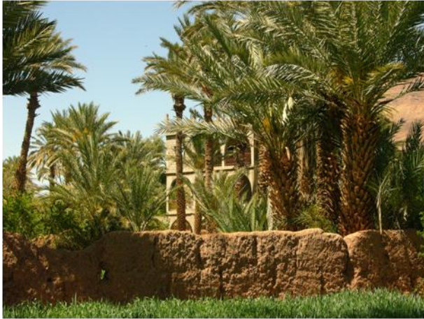
A migrant home in construction in an oasis

investments. The digging of private wells enabled farmers to ignore the traditional, rigid and conflict-ridden collective water allocation system. Many pump-owning families now sell water to generally poorer families who do not own a pump and private well. So, although this collective water management crisis is of a more general nature and can be found in most of Morocco, migration and remittance-fuelled investment have accelerated the trends towards further privatisation of land and water. Land acquisition and people's relation to the land in the oasis economy have also