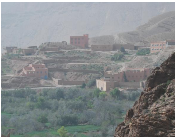
Large migrant homes in the Dades valley

Evaluations of 'migration and development' also depend on the timeframe adopted. Migration impacts might be more negative in the short run but more positive in the long run, or the type of investments by migrants might change over time, as settlement progresses and migrants start returning or, importantly, if development and investment conditions in origin countries change.