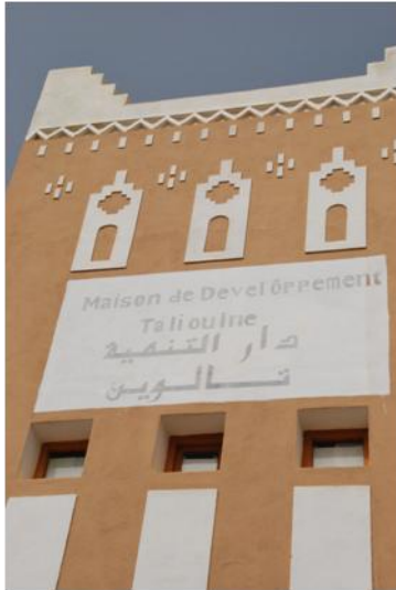
One of the sites of the association Migrations et Développement