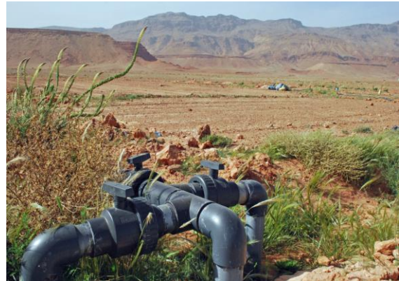
Irrigation system for the cultivation of date palm trees in the village of Afanour

maintaining the trees. The water is provided by a collective solar energy pump. The project is supported by the Catalan development agency Fons Catala and the Moroccan Consultative Council of Human Rights, which is providing reparations for the human-rights abuses experienced in the village in the 1970s. So, while the idea of the project originated with non-migrant leaders of the association, the migration dimension of this project consists of the fact that a migrant, whose origins are in the village, works for the agency Fons Catala, which has facilitated finding access to funding. As this project was initiated only a few years ago, it is too early to evaluate its success.