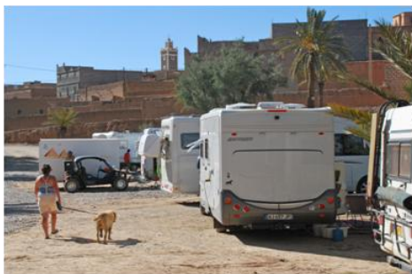
European elderly tourists reaching southern Morocco in their recreational vehicles and vacationing at the Casbah guesthouse

Likewise, the surging investments in small hotels, restaurants, camping grounds and guesthouses (modern or traditional urban-style riads which are sprouting up throughout the Moroccan countryside), which we witnessed during the study tour, cannot be dissociated from the general boom in tourism to Morocco and the national '2010 Vision' campaign to boost tourism to Morocco, which targets migrants both as potential visitors as well as investors. Investments in tourism are actively stimulated by the government, which has for instance simplified procedures to obtain licences to start small hotels and has apparently contributed to a rapid increase in the number of small tourist guesthouses in the Moroccan countryside. In addition, the growing numbers of tourists – including a rapid rise in 'recreational-vehicle based' tourism by European retirees – has fuelled investments in guesthouses, restaurants and campsites in southern Morocco.