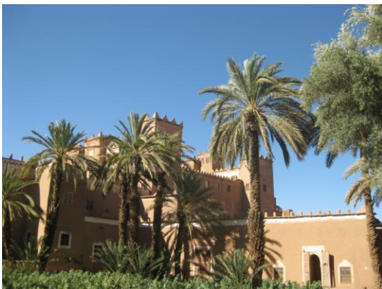
An old Casbah transformed into a guesthouse and camping grounds by a former migrant and his family

The visit to another oasis in the vicinity of Agdz provided further evidence of the impact of emigration on the oasis economy. The group visited a former emigrant to France who built his house in the palm grove, challenging traditional customs which prohibit building in the palm grove, where the land is scarce, extremely fertile, at risk of flooding and highly priced. Rather, houses are built on the edges of the palm grove to avoid any loss of farmable land, on a slightly elevated area without risk of flooding. The migrant is politically active in Morocco, and was also a unionist and associative leader in France. He has a second residence in Casablanca, where he spends a lot of time, and is head of the local village development association. The aims of this association are to promote innovative initiatives in support of poor people, mainly through the