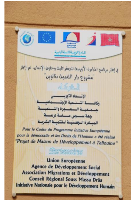
Plaque listing the partners in one project by the association Migrations et Développement.

The role played by European receiving states is highlighted through the funding of emigrant projects (e.g. guesthouses and agricultural cooperatives) by European governments or state-funded development agencies. Such 'co-development' policies are as paradoxical as sending-country policies concerning migration and development. They are, at the same time, based on the idea of encouraging return migration and decreasing migration through creating local economic and employment opportunities. So, migration paradoxically becomes a medicine to