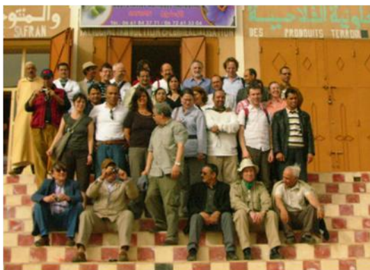
Study group participants in Taliouine

increasing the positive development impacts of migration.