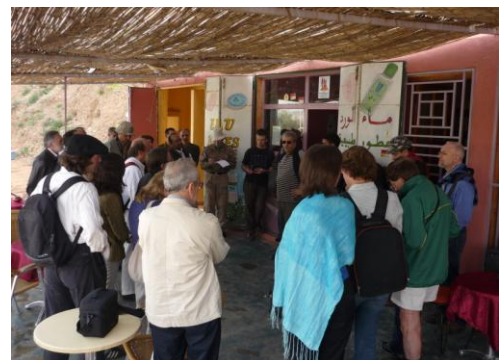
Rose essence distillery in the Dades valley

The third day of the study tour led the participants to the Dades valley east of Ouarzazate. The day started with a visit to a distillery of rose essence. This enterprise was set up by two brothers, one a chemistry engineer based in France and the other brother based in Morocco, where he manages the distillery. The roses are grown by local farmers, then they are collected and distilled into an essence. Approximately 50 per cent of the product is sent to France where the migrant brother uses it to manufacture various cosmetic products, which are sold mainly in regional markets, or to big cosmetics companies. The migrant brother had the idea of setting up this enterprise after he migrated to France, and since then he has been the driving force behind this project. I has not received any support from a funding body or association. In order to improve the marketing of the product, the two brothers are trying to create a cooperative among local rose essence producers. They have also applied to obtain an 'eco-label' to strengthen their commercialisation strategy.