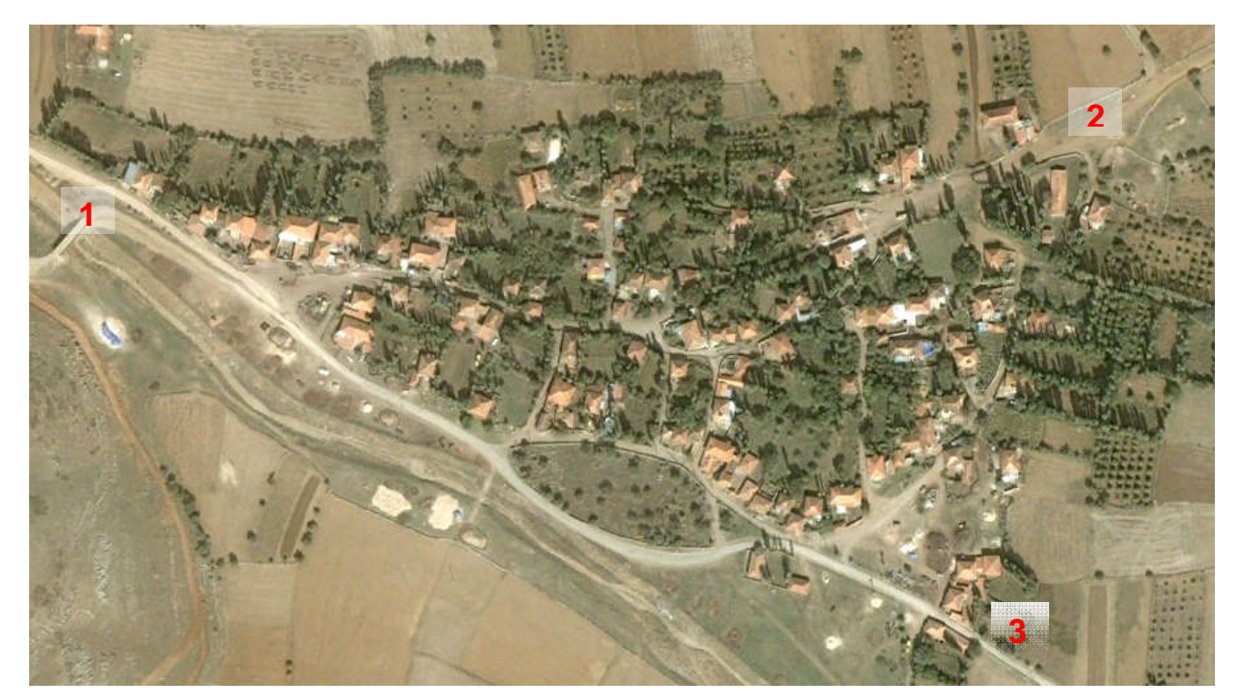
Figure 3 Example of numbered entrances

The supervisors should bring maps of each selected cluster with them to the field, so that they know where the borders of the clusters are. If paper maps are not available, print-outs from Google Maps or other aerial photographs can be used.