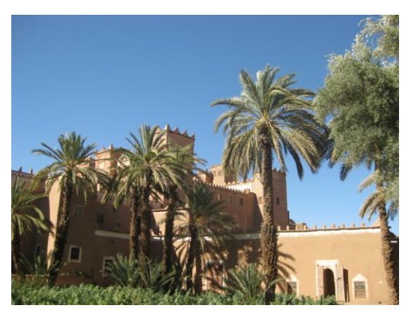
An old Casbah transformed into a guesthouse and camping grounds by a former migrant and his family

The visit to another oasis in the vicinity of Agdz provided further evidence of the impact of emigration on the oasis economy. The group visited a former emigrant to France who built his house in the palm grove, challenging traditional customs which prohibit building in the palm grove, where the land is scarce, extremely fertile, at risk of flooding and highly priced. Rather, houses are built on the edges of the palm grove to avoid any loss of farmable land, on a slightly elevated area without risk of flooding. The migrant is politically active in Morocco, and was also a unionist and associative leader in France. He has a second residence in Casablanca, where he spends a lot of time, and is head of the local village development association. The aims of this association are to promote innovative initiatives in support of poor people, mainly through the