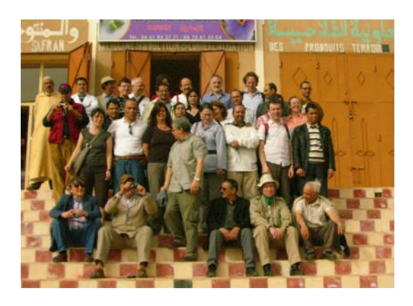
Study group participants in Taliouine

Field visits are a key component of this project because they encourage participants to make direct observations of the development impacts of migration in major sending areas. Participants' observations provided a basis for discussions in the field and during the ensuing wrap-up seminars, during which the comparison between Moroccan and Mexican experiences remained central. These events provided the opportunity for researchers, policy makers and representatives of immigrant organisations from the US, Mexico, Europe and Morocco to observe not only direct and indirect investments of emigrants and returnees, but also the wider socio-economic, demographic and political impacts of migration. The confrontation with realities in the field also exposed participants to the diversity of migration impact, and sparked discussions about which conditions explain such diversity, and how policies can contribute to