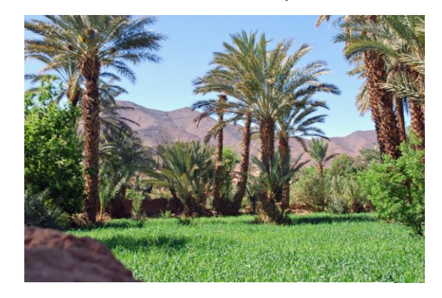
Clover cultivation in the oasis near Agdz

This crisis around the collective management of water resources has encouraged land owners to dig private wells and install diesel pumps on their plots. Those who did so were primarily emigrants, as remittances enabled them to make these