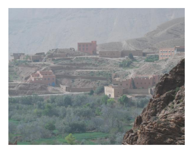
Large migrant homes in the Dades valley

Evaluations of 'migration and development' also depend on the timeframe adopted. Migration impacts might be more negative in the short run but more positive in the long run, or the type of investments by migrants might change over time, as settlement progresses and migrants start returning or, importantly, if development and investment conditions in origin countries change.