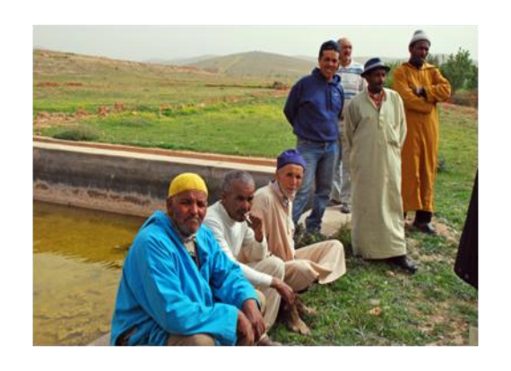
Saffron farmers in supported by Migrations et Développement

In the afternoon, a visit to a saffron cooperative in the vicinity of the small town of Taliouine highlighted the sorts of rural development projects carried out by Migrations et Développement. M&D had played a key role in initiating this development by installing wells, pumps and a collective irrigation system as well as by organising the farmers into a cooperative. The farmers' own contribution consisted of making the soil arable by breaking the crust, removing stones and ploughing. M&D further supports the cooperative by developing opportunities for the commercialisation of saffron, including the opening