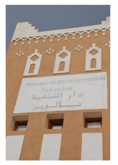
One of the sites of the association Migrations et Développement