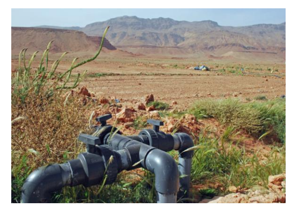
Irrigation system for the cultivation of date palm trees in the village of Afanour

maintaining the trees. The water is provided by a collective solar energy pump. The project is supported by the Catalan development agency Fons Catala and the Moroccan Consultative Council of Human Rights, which is providing reparations for the human-rights abuses experienced in the village in the 1970s. So, while the idea of the project originated with non-migrant leaders of the association, the migration dimension of this project consists of the fact that a migrant, whose origins are in the village, works for the agency Fons Catala, which has facilitated finding access to funding. As this project was