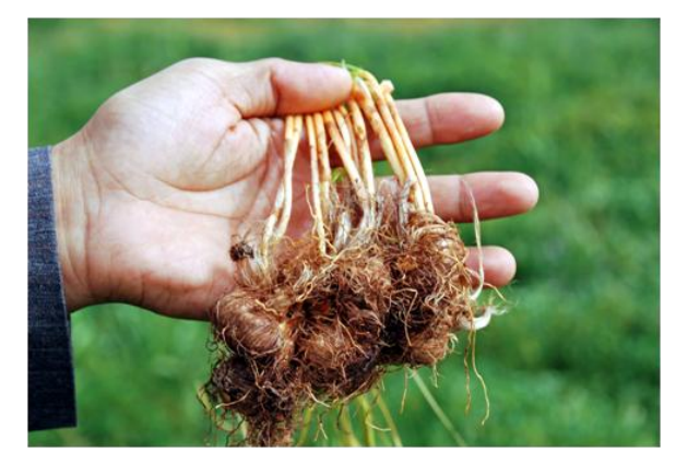
Bulbs of the saffron plant extracted from one of the plots cultivated with the support of the association Migrations et Développement

One of the strategies pursued by the association is to use their development work to 'provoke' the Moroccan state by highlighting the failures of state development policies and the ability of local communities and migrants with limited resources to coordinate efforts and produce lasting results. M&D has recently helped to bring electrification, drinking water and other rural development projects to regions that were deemed 'too remote' and 'too difficult' for such projects to succeed. This has been followed up by state-initiated rural development programmes.