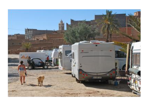
European elderly tourists reaching southern Morocco in their recreational vehicles and vacationing at the Casbah guesthouse

Likewise, the surging investments in small hotels, restaurants, camping grounds and guesthouses (modern or traditional urban-style riads which are sprouting up throughout the Moroccan countryside), which we witnessed during the study tour, cannot be dissociated from the general boom in tourism to Morocco and the national '2010 Vision' campaign to boost tourism to Morocco, which targets migrants both as potential visitors as well as investors. Investments in tourism are actively stimulated by the government, which has for instance simplified procedures to obtain licences to start small hotels and has apparently contributed to a rapid increase in the number of small tourist guesthouses in the Moroccan countryside. In addition, the growing numbers of tourists – including a rapid rise in 'recreational-vehicle based' tourism by European retirees – has fuelled investments in guesthouses, restaurants and campsites in southern Morocco.