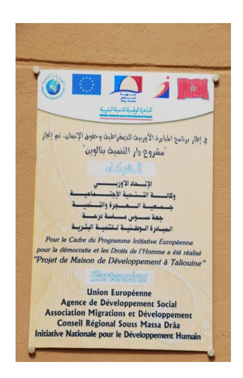
Plaque listing the partners in one project by the association Migrations et Développement.

Particularly in the wake of structural adjustment policies, the relative absence and even withdrawal of the Moroccan state from rural development has left a vacuum