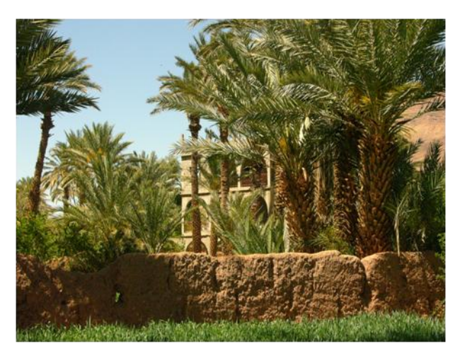
A migrant home in construction in an oasis

investments. The digging of private wells enabled farmers to ignore the traditional, rigid and conflict-ridden collective water allocation system. Many pump-owning families now sell water to generally poorer families who do not own a pump and private well. So, although this collective water management crisis is of a more general nature and can be found in most of Morocco, migration and remittance-fuelled investment have accelerated the trends towards further privatisation of land and water. Land acquisition and people's relation to the land in the oasis economy have also