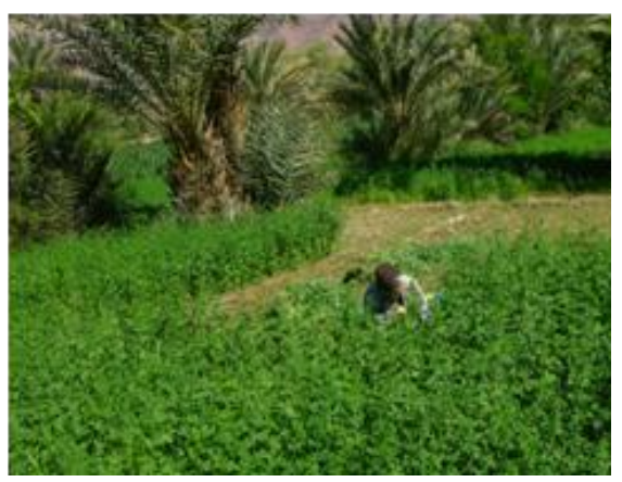
A woman working in a plot of land in the oasis

The field visits confirmed that integration in receiving societies often coincides with increased capabilities to invest in Morocco. Migrants' socioeconomic status and education, as well as their integration in receiving countries, have been crucial factors enabling their investments in Morocco as well as their participation in collective development initiatives. For instance, the rose distillery was initiated by a chemist trained in Morocco and in France who relied on his technical