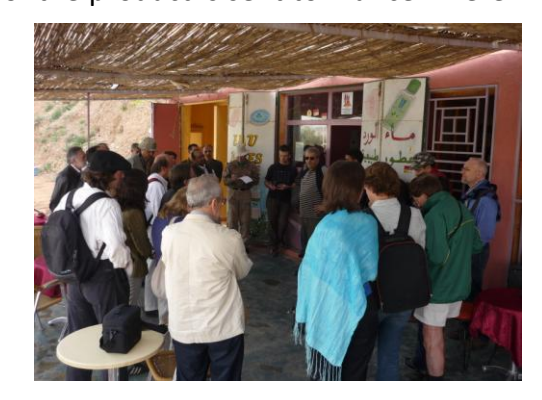
Rose essence distillery in the Dades valley

the migrant brother uses it to manufacture various cosmetic products, which are sold mainly in regional markets, or to big cosmetics companies. The migrant brother had the idea of setting up this enterprise after he migrated to France, and since then he has been the driving force behind this project. I has not received any support from a funding body or association. In order to improve the marketing of the product, the two brothers are trying to create a cooperative among local rose essence producers. They have also applied to obtain an 'eco—label' to strengthen their commercialisation strategy.