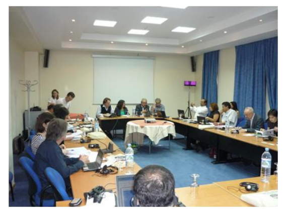
Opening session of the study tour

On the first day of the study tour in the region of Ouarzazate, a series of presentations outlined the objectives of the project and this study tour, and reviewed the main results from the previous field visit in Zacatecas. The presentations provided a comparative perspective on the interactions between migration and development in Mexico and Morocco, including a review of the activities of the Fondation Hassan II pour les Marocains Résidents à l'Étranger and an insight into Mexican policies for migration and development.