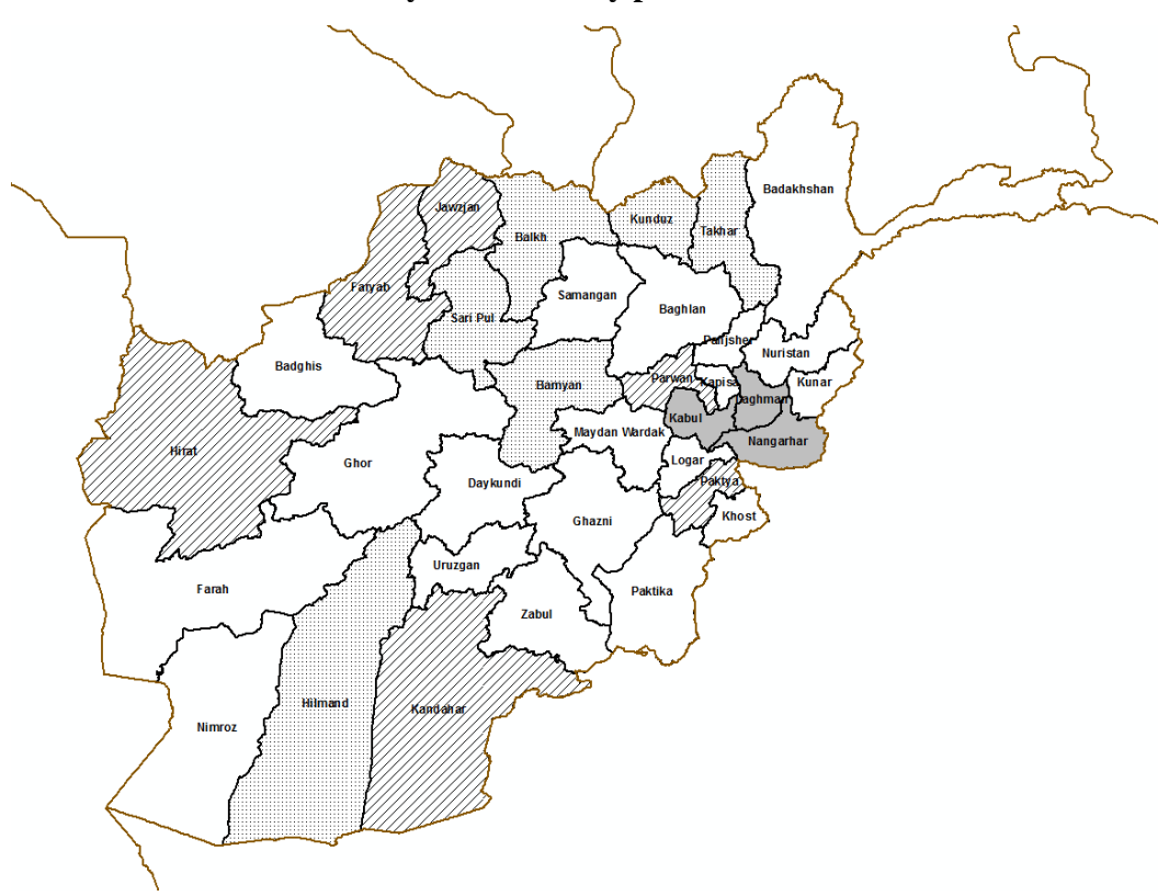
Figure 2: Distribution of beneficiary households by province.

Nangarhar. Although these were spread out over 43 distinct villages across six separate districts, we restrict our focus only to the UNHCR program in this paper.